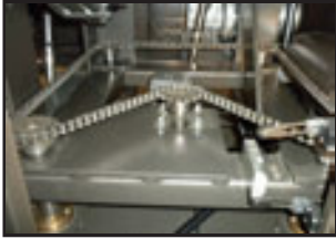
Motorized adjustment of seal head - No handles to adjust!