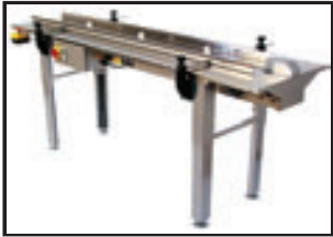
Optional 3' or 6' flighted or belted infeed conveyor