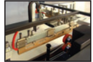
Vertical seal head with one piece seal knife and blade 2 yr warranty on seal blade