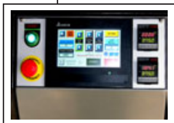
6" color touch screen with 12 presets and self diagnostics

"APA" machine automatically adjusts inverting head and infeed conveyor to different package sizes from one touch control panel in less than 15 seconds!